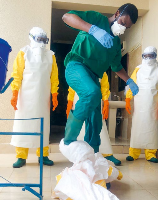
Doffing of personal protective equipment for high consequence infectious diseases in Rwanda

jects address surveillance, including genomic surveillance and bioinformatics, laboratory diagnostics and infection prevention and control. Projects also deal with the animal-human-environmental health interface (One Health) and digital approaches to outbreak prevention and management. Apart from bilateral partnerships and cooperations with international public health actors, the Robert Koch Institute connects different partner countries and institutions by offering joint workshops and training programmes.