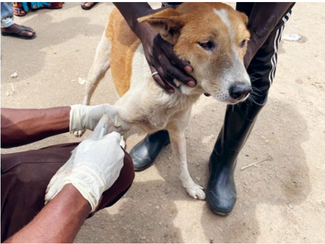
Taking samples in Nigeria for research on zoonotic spillover of pathogens from animals to humans

3-year strategic projects strive to establish and expand longer-term partnerships for strengthening public health capacities and institutions with partner countries. 1-year projects respond to ad-hoc needs, pilot the implementation of innovations or serve as precursor to potential strategic projects. More information on the RKI-led projects in the second phase of the Global Health Protection Programme can be found in this flyer and online ( www.rki.de/ghpp-en ).